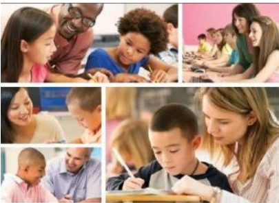
CELEBRATING ALBERTA'S TEACHERS AND PRINCIPALS