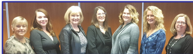
Board of Trustees of Black Gold Regional Division No. 18

The Chairman or Vice-Chairman and the Superintendent or Associate Superintendent—Business & Finance will be the signing authorities for Black Gold Regional Division No. 18 for 2018-2019.