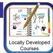
Locally Developed Courses

The Board approved the extension of the authorization date for the following course: