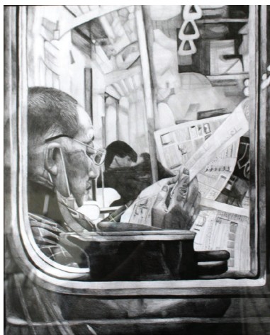
Calley Rustand "New Normal" graphite on paper, 2022