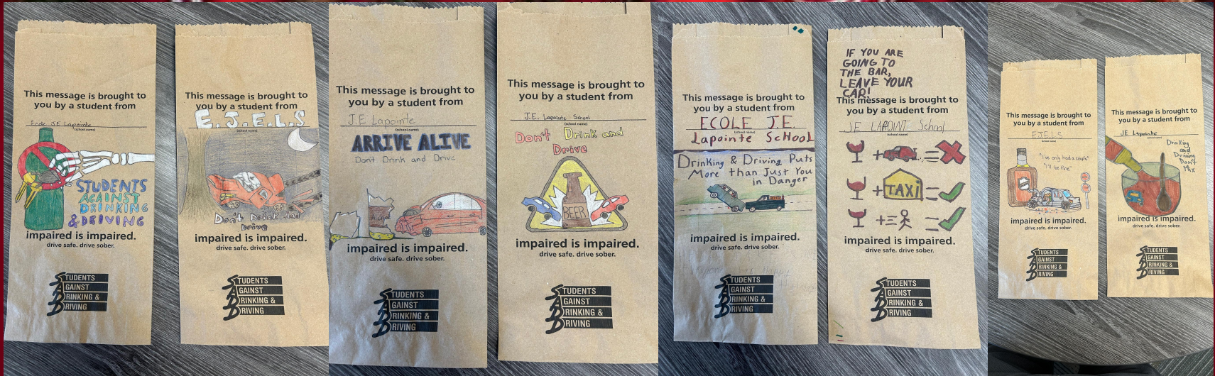
École J. E. Lapointe School staff and students had some great conversations about the dangers of drinking and driving while students created their liquor bags. Thank you SADD Alberta for this initiative.