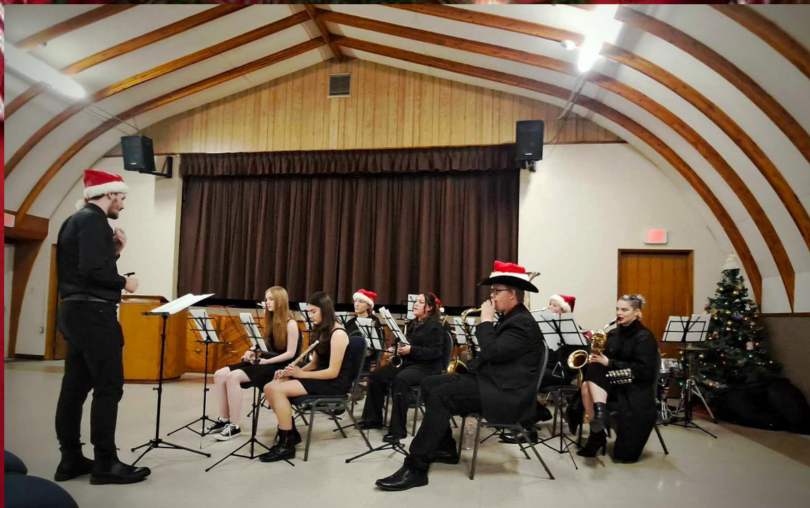
The New Sarepta Community High School band provided the entertainment at Cloverlawn's annual community Christmas potluck.