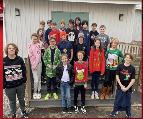
Some festive season class photos from École Coloniale Estates School.