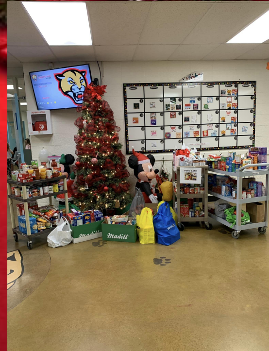
École Corinthia Park School continued their 12 Days of Christmas with A Day of Giving. What a wonderful show of support for the Leduc Food Bank!