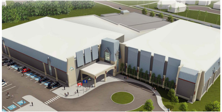
The new Beaumont Sport and Recreation Centre Project is an expansion and modernization of the existing Aqua-Fit Centre to include a National Hockey League sized ice surface, an indoor fieldhouse, a high school gymnasium, a climbing wall, and a suspended running track.

Welcome back Beaumont! First and foremost, thank you to our local families, staff and students for making this fall's school re-entry safe and smooth. Our staff have worked hard to make this transition a smooth one while we adapt to our altered reality of masks and social distancing.