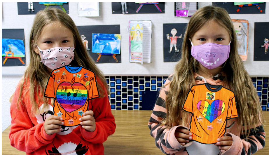
A pair of East Elementary students took part in this year's Orange Shirt Day to show solidarity with residential school survivors, and to declare that every child matters.

I value that our division is forward thinking and student driven, collaborative and respectful. Our teachers and staff are innovative and want nothing more than to inspire success in our students.