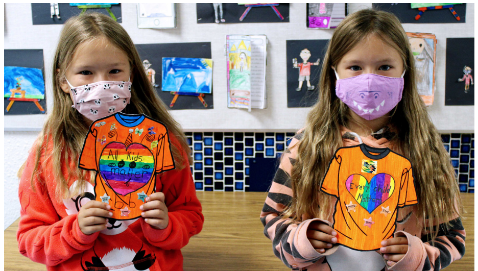
A pair of East Elementary students took part in this year's Orange Shirt Day to show solidarity with residential school survivors, and to declare that every child matters.

I love the outdoors, camping, canoeing, campfires, spending time with family and volunteering in the community.