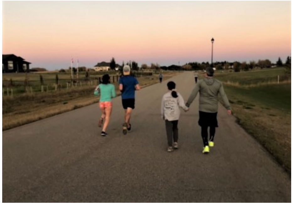
Calmar Secondary School students taking part in their annual Nowhere to Run Mental Health Awareness Run/Walk on October 4.

Welcome back everyone - it's so wonderful to hear your back to school stories! I know some of those stories carry a little more stress than they have in other years, but we as the Black Gold family will get through this together.